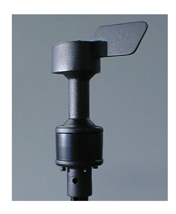
IceFree3_AnemometerVaneWRA_Manual Rev. 4.0